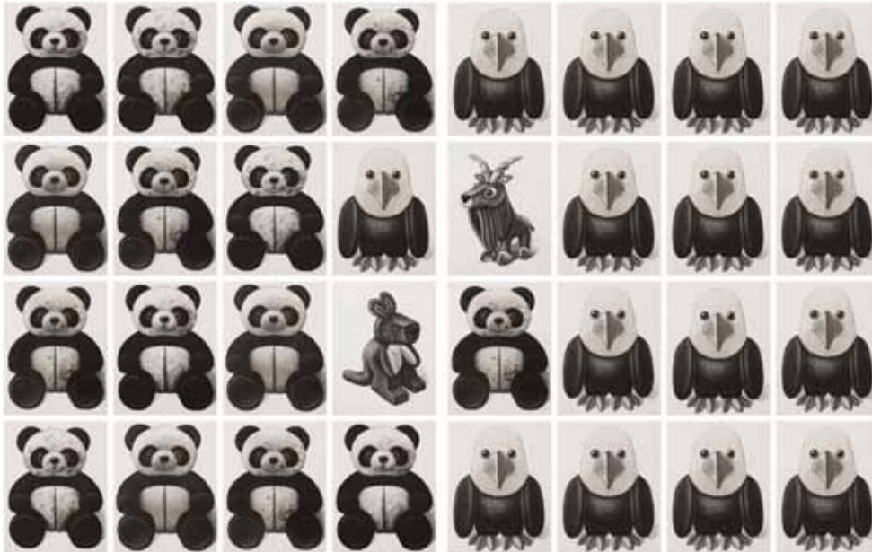
left Michael Kempson, Friends and Acquaintances , 2013, etching and aquatint on Velin Arches 300gsm paper, unique-state print, installation of 32 panels (each panel 27.5 x 21.5 cm), installation dimensions variable. right Ben Rak, Arab Sheikh Bobble , Perceive-Conceive series, 2013, acrylic silkscreen on BFK Rives 280gsm paper, edition of 11, 56 x 38 cm.