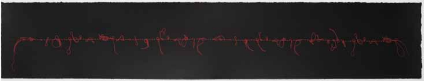
Roohi Shafiq Ahmed, Seemingly Horizontal , 2013, screenprint on BFK Rives 300gsm paper, edition of 12, 19 x 104 cm.